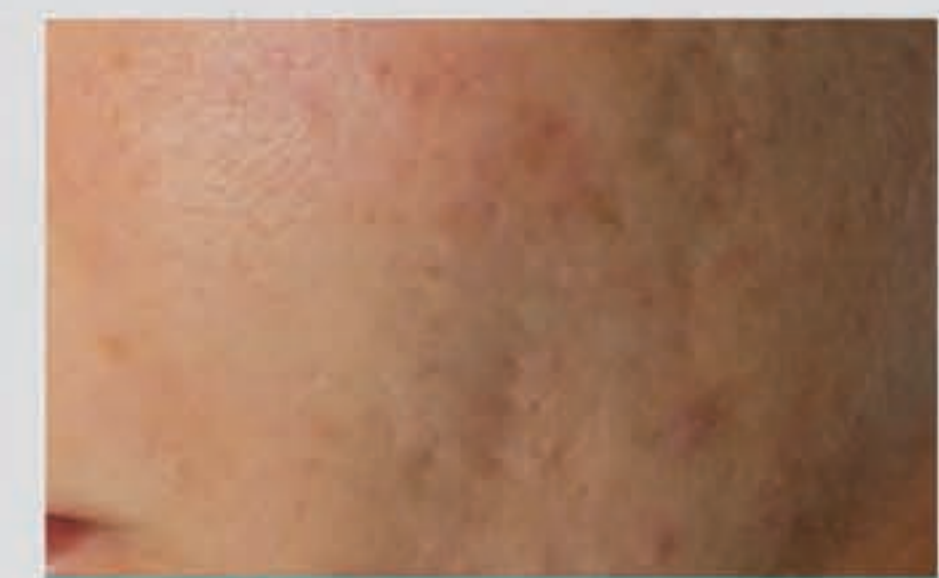
After Six Treatments